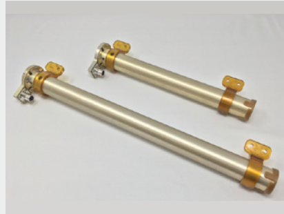
FUEL QUANTITY PROBE