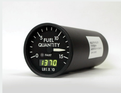
FUEL QUANTITY INDICATOR